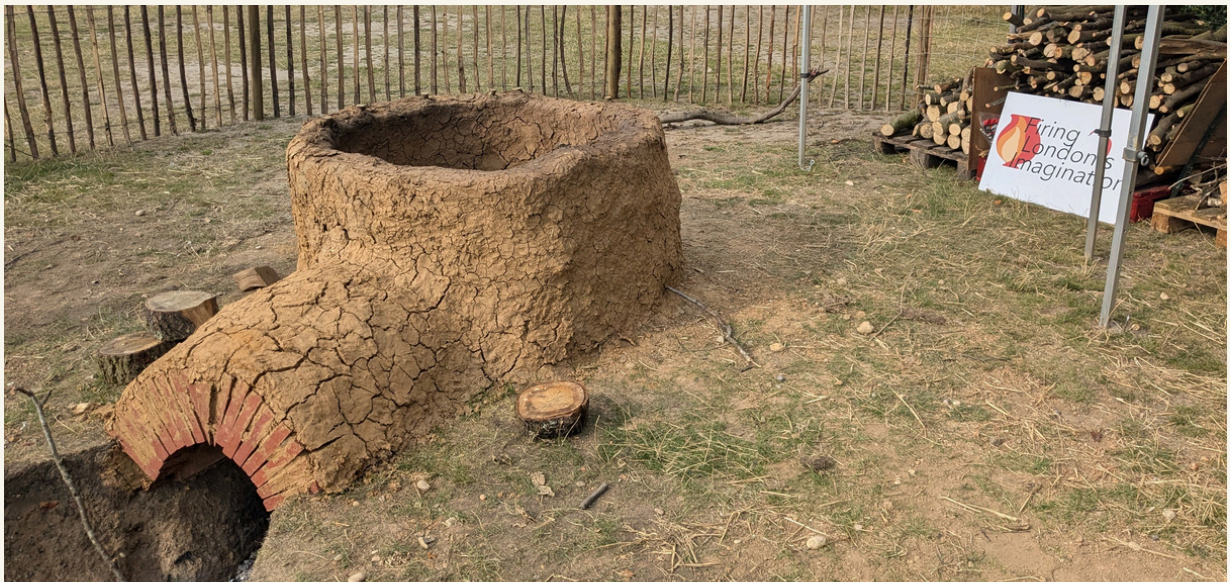
Photo of replica Roman Kiln in Highgate Wood.

This kiln was first fired at Highgate Wood Community Heritage Day on 1st September 2024. A second firing also took place in collaboration with Turning Earth on the 21st September 2024.