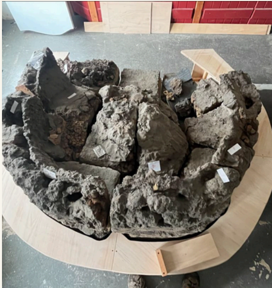
Photo of the kiln sections in the conservation studio.