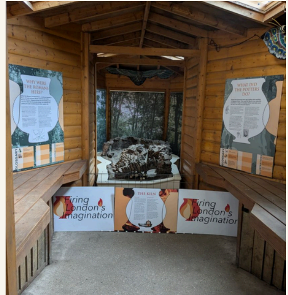
Photo of temporary Roman kiln exhibition.

The Roman kiln was previously stored in Bruce Castle Museum in disassembled sections since the 1990's. In early February 2024, the sections of the kiln were removed for conservation by the specialists in clay and traditional building materials of the Natural Building Centre in Conwy, North Wales.