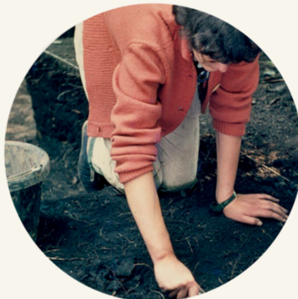
Photo of excavation at Highgate Wood in 1968.

One of the kilns was so well preserved that it was lifted out of the ground in 1968. It was first exhibited at the Horniman Museum then Bruce Castle Museum, Haringey until 1997, when most of it was placed in pieces in store.